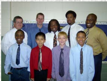
Garden Hills' Gentleman's Club

Visit us on the web at: http://www.champaignschools.org